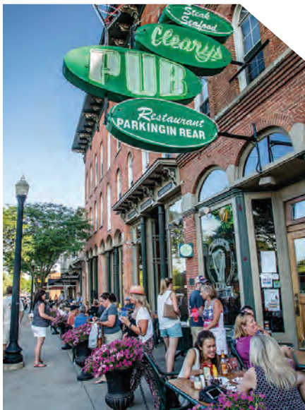
Above: Cleary's Pub patio packed for the Rock the Block festival.

*Since Main Street America program began