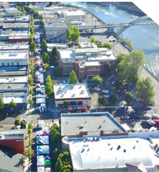
Aerial view of the First City Celebration.

*Since Main Street America program began