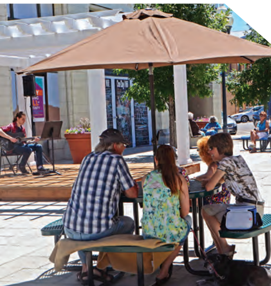
Community members attend the free Brown Bag Concert Series.

*Since Main Street America program began